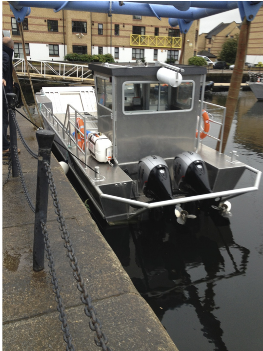
Crane Launch, weight 4000kgs

Coding and inspection was carried out by Mecal UK Ltd Full Stability booklet also created by Mecal UK Ltd