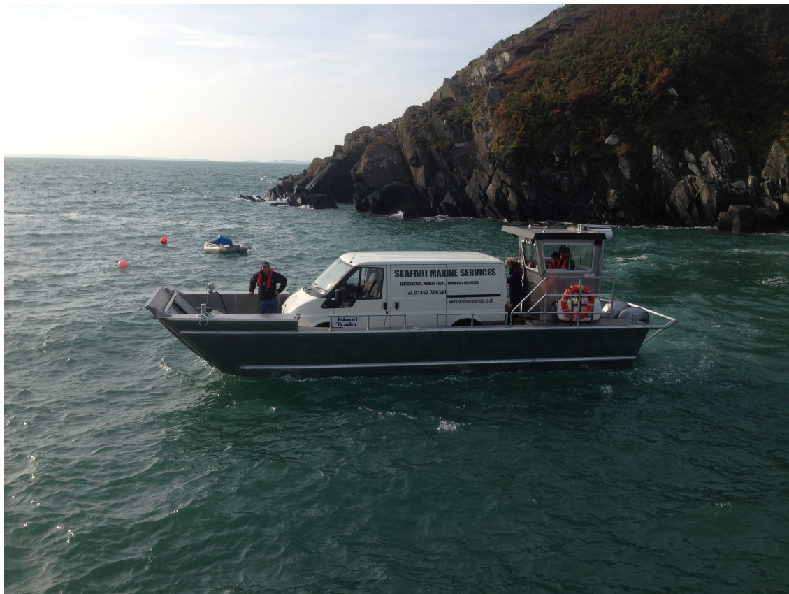
Delivering transit van to one of the Islands

Delivery can be arranged at cost price to a UK port of your choice. Any sea trials welcome.