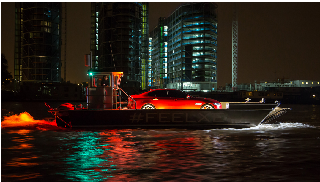
Jaguar XE Promotion, London See the landing craft in action here.

http://www.youtube.com/watch?v=qUFxdvleomw