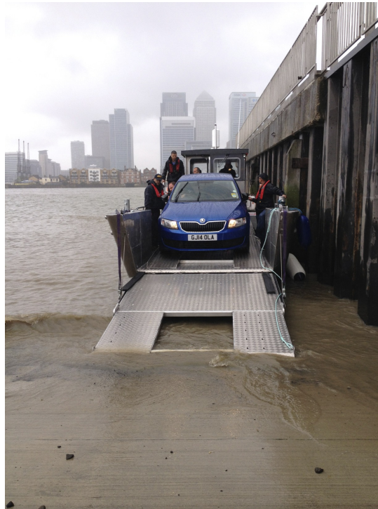
Sea trials on River Thames